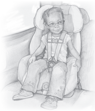
FIGURE 4. Forward-facing car safety seat with harness.