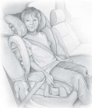
FIGURE 5. Belt-positioning booster seat.