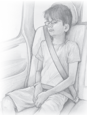
FIGURE 6. Lap and shoulder seat belt.